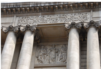
Theme Applies to Moral Force